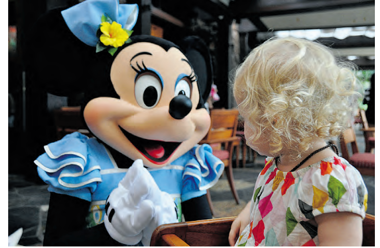
At Aulani, kids get to mingle with Disney characters.

The oceanfront patio at Azure Restaurant in The Royal Hawaiian Hotel is my little piece of heaven in Waikiki. Under a canopy of twinkling lanterns, you'll dine on freshly caught fish (hand-picked at the auction that very morning), while listening to waves thunder on the shore. Try the five-course