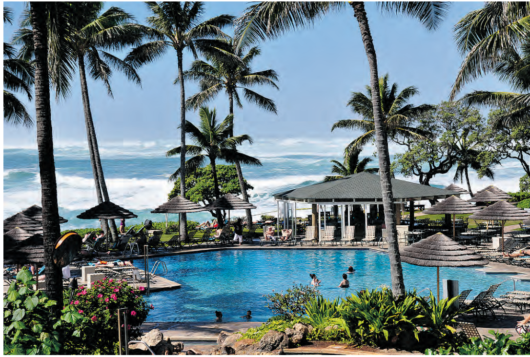
You can watch the North Shore waves from the comfort of the pool at Turtle Bay Resort.

After a little research, I discovered a couple of services that make travelling to Oahu with kids even easier. Carving out time for a romantic dinner, or an adult-oriented activity such as paddle boarding ensures that all members of our family have a chance to unwind. Through Nannies Hawaii I found excellent care