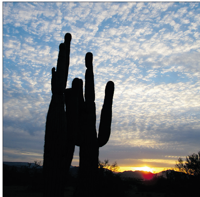
A breathtaking desert sunrise is perfect for a hot-air balloon ride.

Mhairri Cuthbert is a Vancouver-based travel writer at Arrivals.