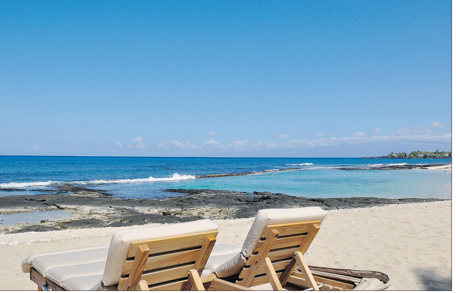
The Four Seasons Hualalai has magnificent spots where you'll be able to get some alone time and a protected bay to swim with sea turtles.

Upon request, a bottle warmer and high chair were delivered. A complimentary washer and drier, complete with detergent suitable for sensitive skin, were located within a few steps of our room