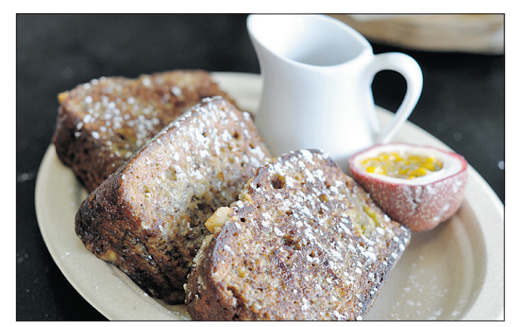
Banana bread French toast at Big Island's Upcountry Bakery.

In the heart of Kailua, you'll find the Hulihee Palace, which was built in 1838 and used as a vacation home for Hawaiian Royalty as well as Mokuaikaua, which was built in 1820 and is the earliest Christian church in the Hawaiian Islands. Our favourite spot in Kailua is Hugo's on the Rocks to