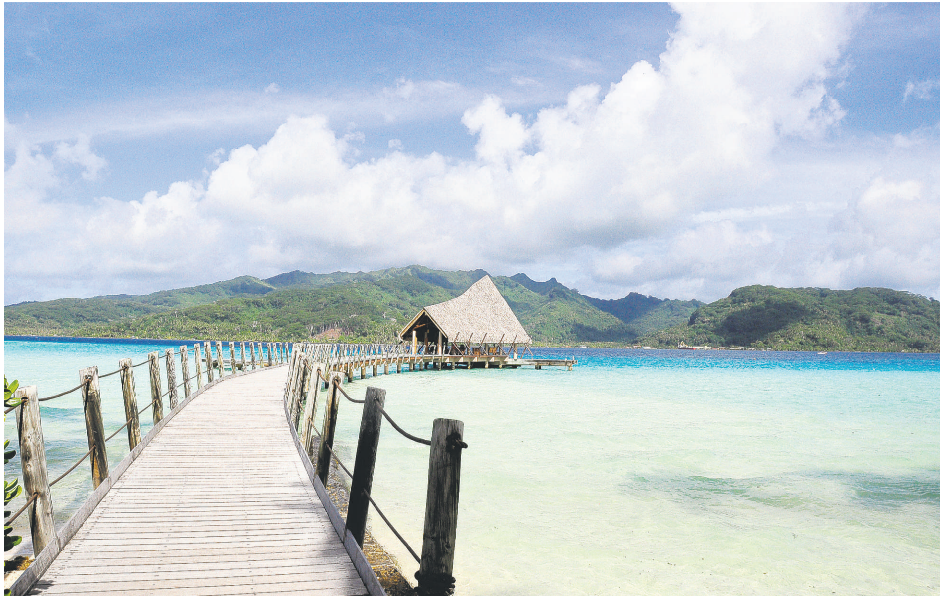
The dock and entrance to Le Taha'a Resort & Spa showcases the magnificent scenery in Tahiti.