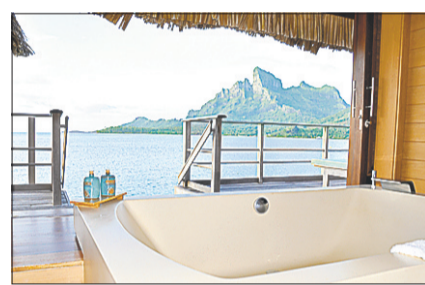
Four Seasons Bora Bora is one of the top hotels, with views of Mount Otemanu.

Va'a (canoe racing) is one of the traditional sports of Tahiti. It is said that a Tahitian's umbilical cord is cut with a rock and a canoe paddle, which is apparent in their dedication to, and appreciation of, the sport. Every year, upwards of 7,000 spectators and fans take to the waters in a myriad of small and large craft boats to support their favourite team in a three-day, 124.5-kilometre paddling race between the islands of Huahine, Raiatea, Taha'a and Bora Bora. Each day, in the blistering hot sun, we were in the heart of the action as our fishing boat navigated rough waters and large swells to cheer on the rapidly paddling teams.