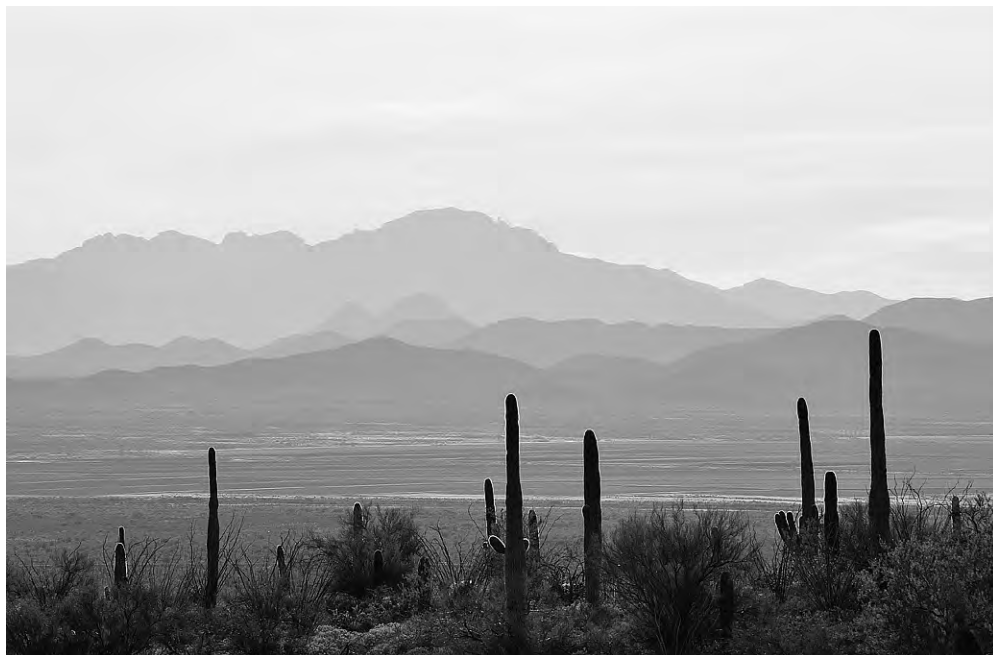
Desert sunset and cacti from the Arizona Sonora Desert Museum are a must-see.

The Westin La Paloma Resort and Spa fit the bill. Having undergone an exten-