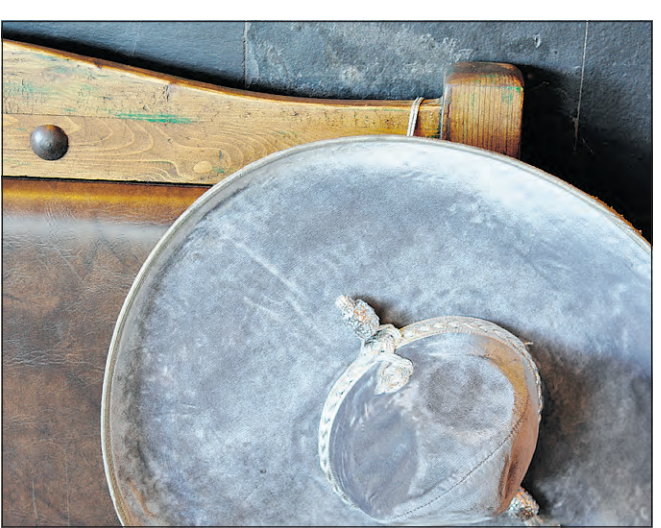
Tucson is bursting with southwestern charm.