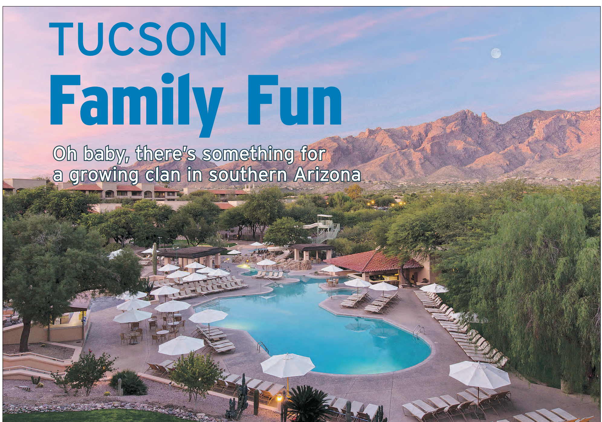
Stunning sunsets and mountain views make a stay at the Westin La Paloma Resort & Spa in Tucson one families will cherish for a long time.