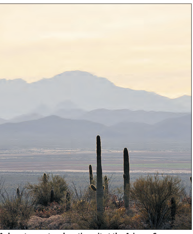
A desert sunset and cacti await at the Arizona Sonora Desert Museum.