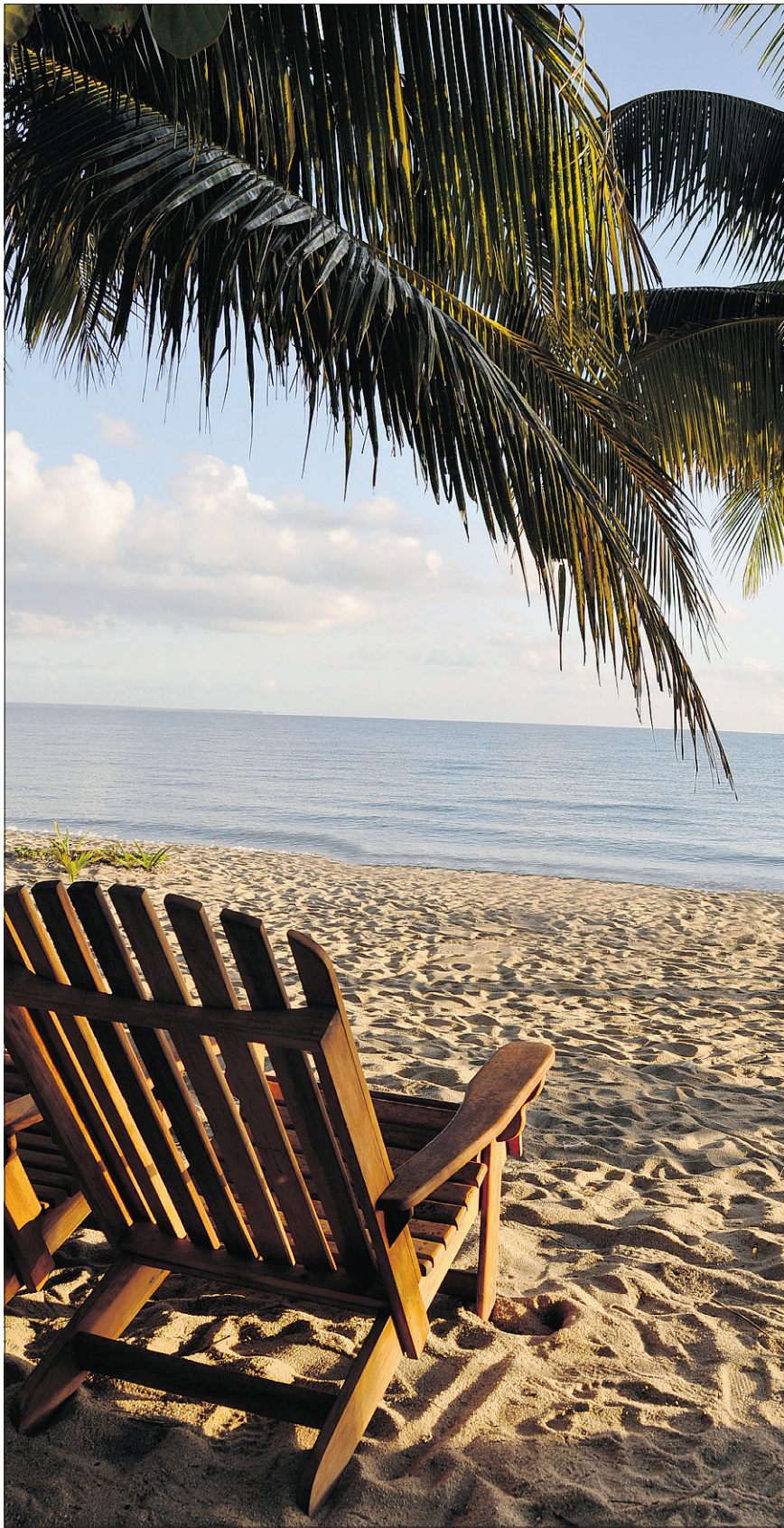
Belize offers beachside tranquillity as well as adventure.

Although the Hamanasi is renowned for its diving and adventure packages, which at six months pregnant I couldn't participate in, we happily spent our time walking the beach, exploring Hopkins, sunning ourselves poolside and visiting the neighbouring Butterflies Spa for couples massages and relaxation treatments.