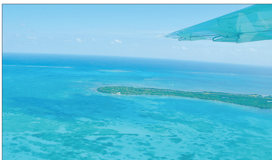
Belize is renowned for its stunning views of the Caribbean Sea.

North of Placencia, on the Caribbean coast, is Hopkins Village, an ideal location for anyone looking to experience