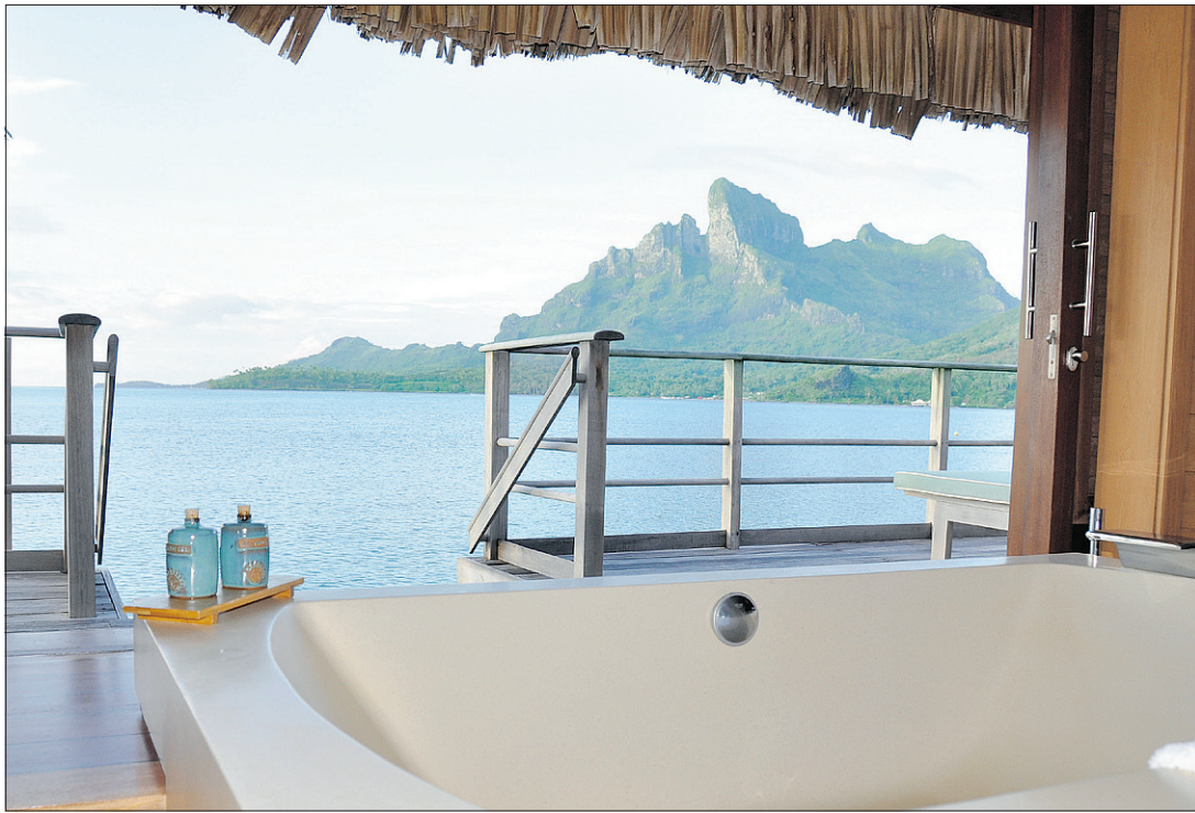
Four Seasons Bora Bora is one of the top hotels, with views of Mount Otemanu.