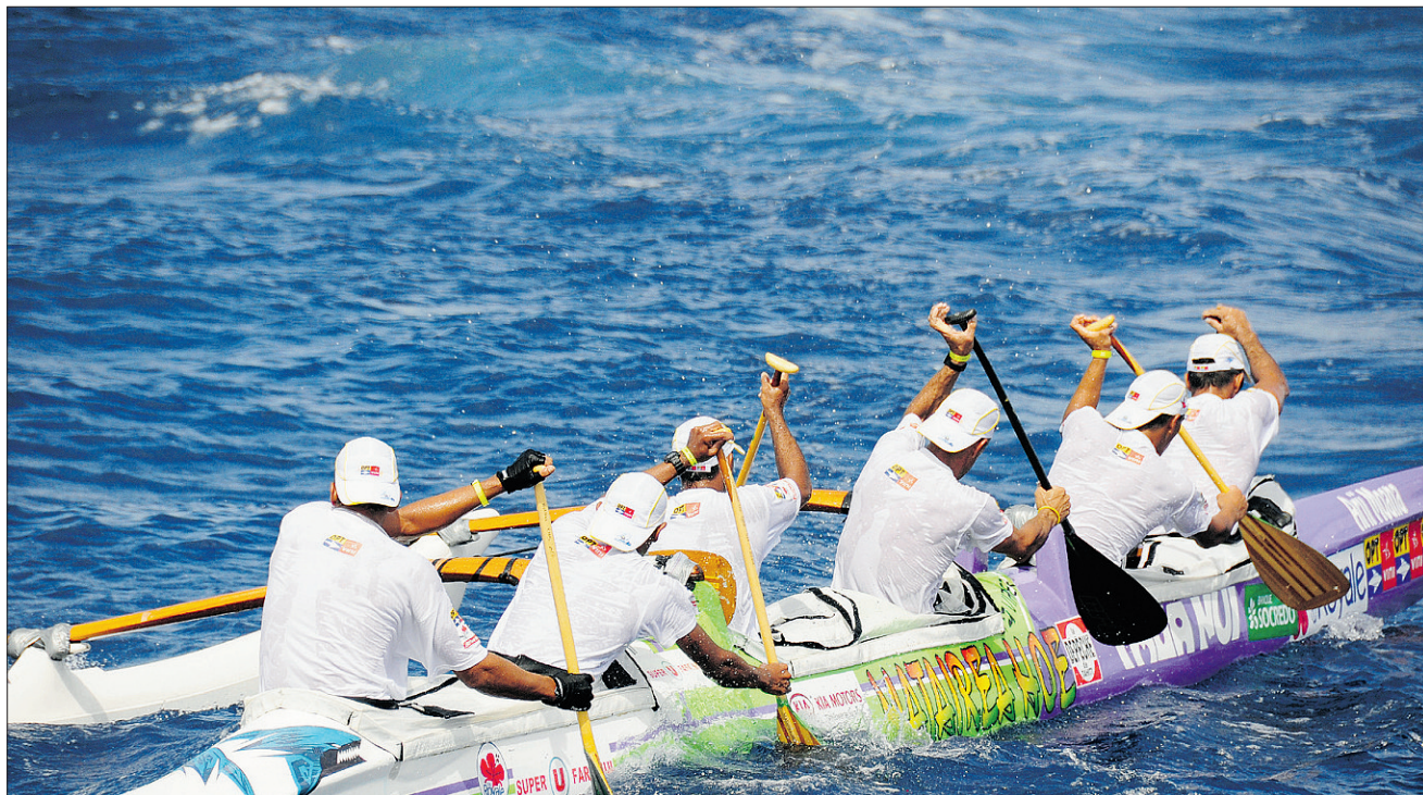
The Hawaiki Nui Va'a race is held over three days and racers paddle over 124 kilometres between the islands.