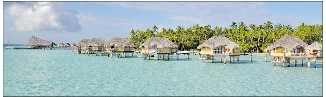
The water colour and views at Le Taha'a Island Resort & Spa are truly unforgettable.