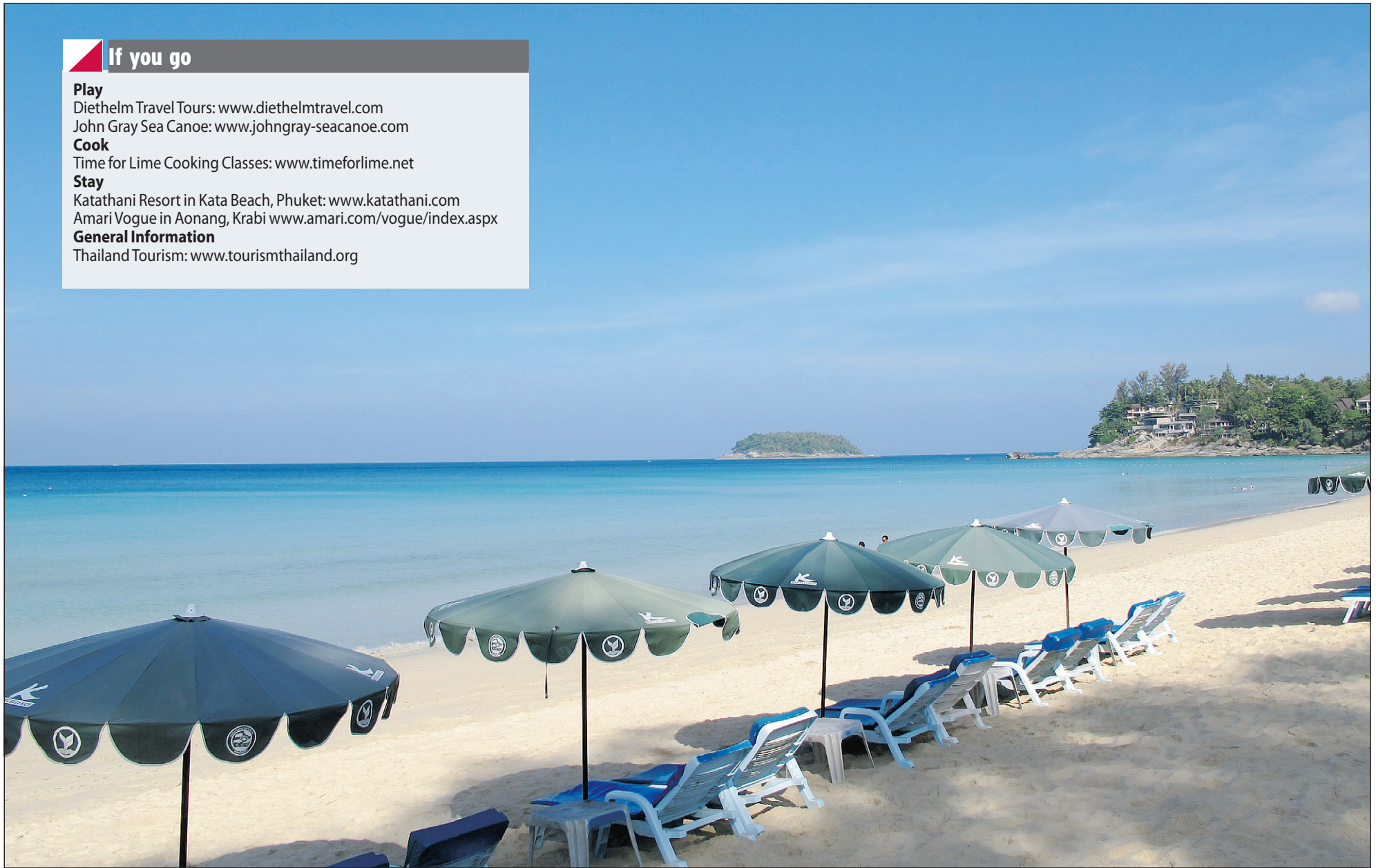
The beaches of Southern Thailand are among the most breathtaking in the world. Kata beach in particular is serene and stunning — perfect for lounging.

If you go Play Diethelm Travel Tours: www.diethelmtravel.com John Gray Sea Canoe: www.johngray-seacanoes.com Cook Time for Lime Cooking Classes: www.timeforlime.net Stay Katathani Resort in Kata Beach, Phuket: www.katathani.com Amari Vogue in Aonang, Krabi: www.amari.com/vogue/index.aspx General Information Thailand Tourism: www.tourismthailand.org