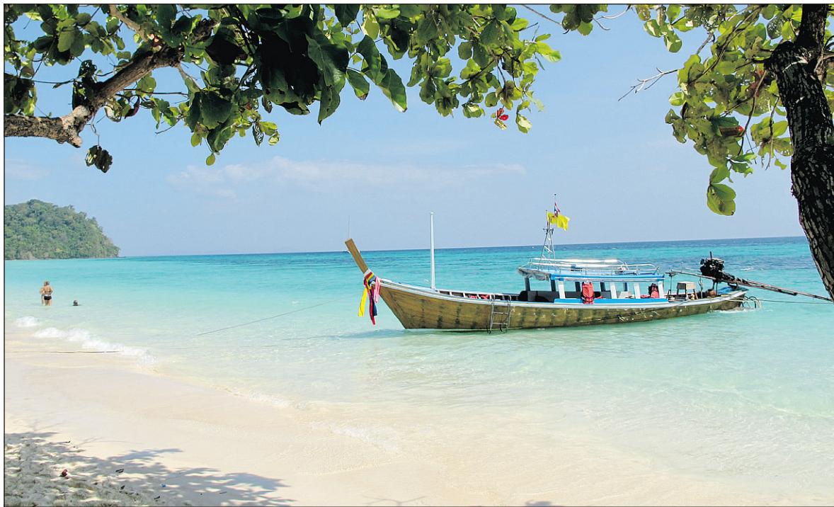
Ko Rok is known for its secluded and unspoiled white sand beaches and crystal clear waters; it's the ideal spot to soak up some sun.

There is no better way to experience Thai cuisine than rolling up your sleeves, donning an apron and hammering spices with a mortar and pestle. While Thai food has gained popularity throughout North America and made its way to the pour-and-stir world of grocers, absolutely nothing compares to the taste of traditionally-prepared curry chicken with freshly made chili paste. Taking a cooking class is one of our favourite ways to experience a destination, as there is so much to learn about a country's history through its cuisine. Thai food beautifully blends the Eastern and Western worlds. Stir frying cooking methods came from China, curries from India and the infamous Thai chili was introduced in the late 1600s by Portuguese missionar-