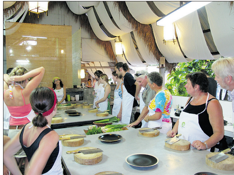
A cooking class is one way to experience the Thai culture and learn how to prepare authentic cuisine.

While it is sometimes difficult to trade an afternoon on the beloved beach chair for more taxing activities, Thailand's countless unspoiled national parks offer a pretty compelling reason to try. Our grand excursion, which took place north of Phuket in Khao Lak, started with a jungle hike to a secluded waterfall. After surviving the somewhat precarious trail, wearing highly inappropriate footwear and not an ounce of sunscreen, we floated down a peaceful stream aboard a bamboo raft and stared in awe at the tropical birds, hand-sized spiders and mildly-poisonous mangrove snakes resting in the treetops. Following a beachfront Thai lunch and swim in the sea, we got up close and personal with nature once again and 'boarded' an elephant to trek through the lush jungle and a rubber tree plantation. If you want to plan your tour in advance we recommend using internationally recognized Diethelm Travel as they provide exceptional service and are extremely professional.