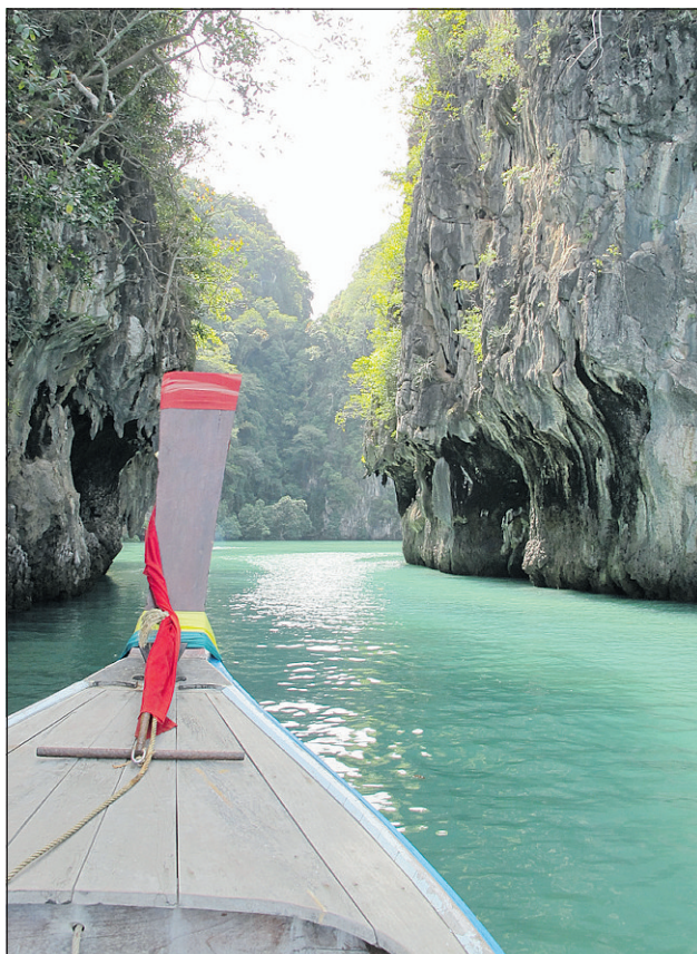
Each Hong is distinct with an ecosystem of jungle flora and fauna and wildlife.