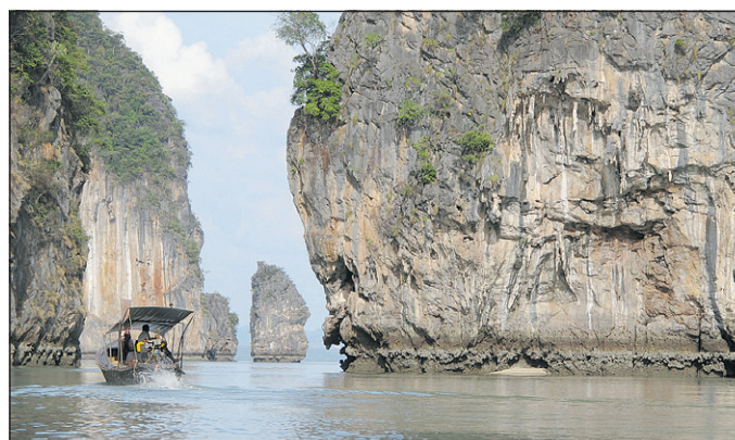
Gray's Seacanoes 'Starlight Hong Trip,' is a once-in-a-lifetime adventure.