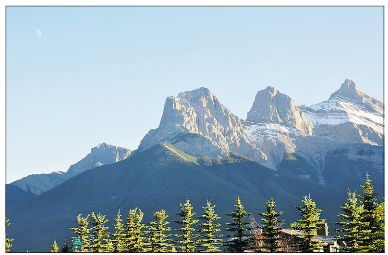
The Three Sisters mountains in Canmore, Alberta rise above the historic old town.

Taking a day-trip to the Banff National Park is a must while in Canmore. We chose the scenic Bow Valley Parkway one-and-a-half hour drive to Lake Louise, hoping to spot some Rocky Mountain wildlife. The winding two-lane road has a maximum speed of 60 kilometres an hour, which is the perfect pace to take in the jagged mountain peaks, crystal lakes and colourful wildflowers.