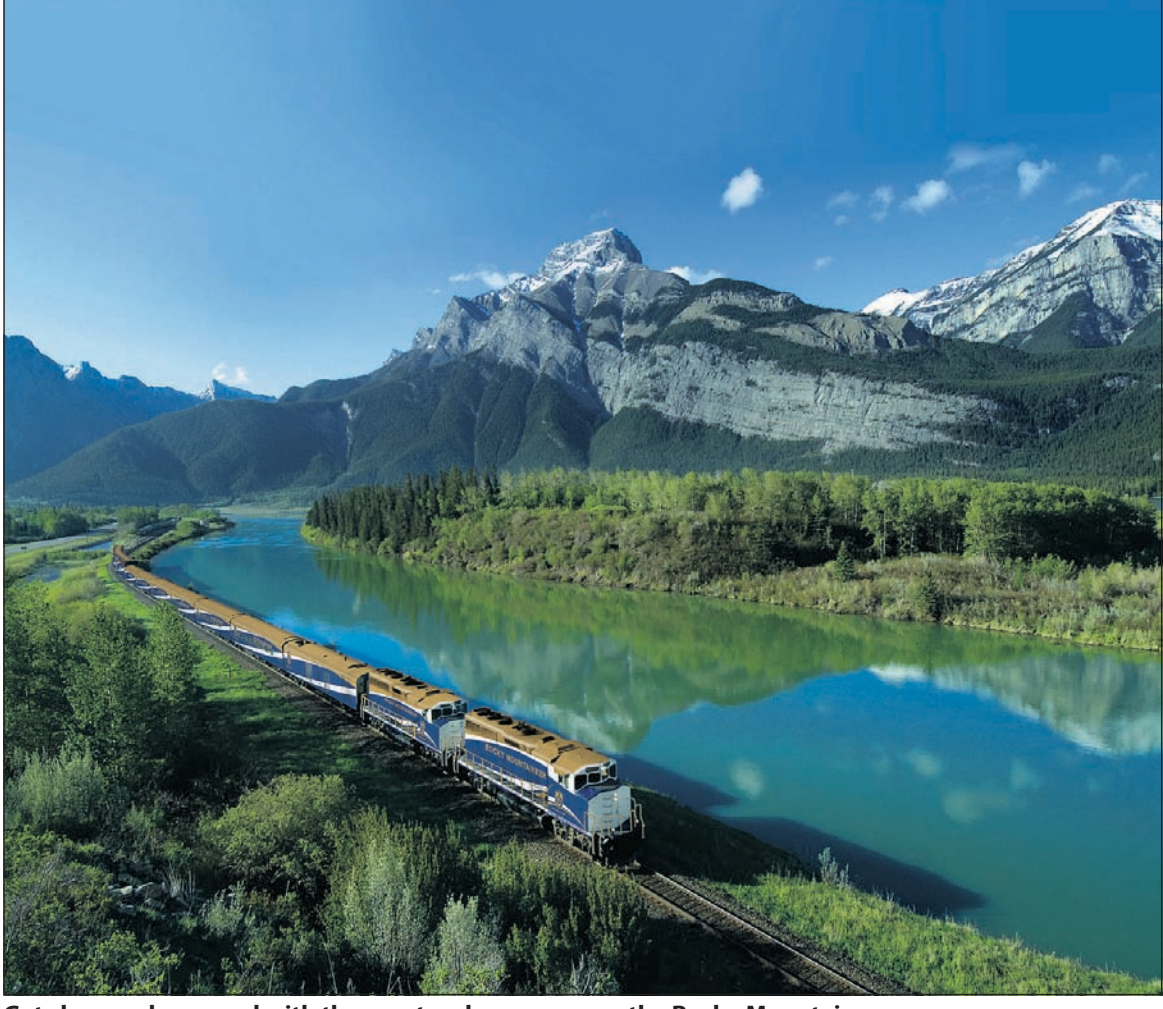
Get close and personal with the spectacular scenery on the Rocky Mountaineer

All the while, our on-board attendants shared scenic and historical facts while keeping our wine glass topped and bellies full. By the time we reached Banff I was rested and ready for exploration.