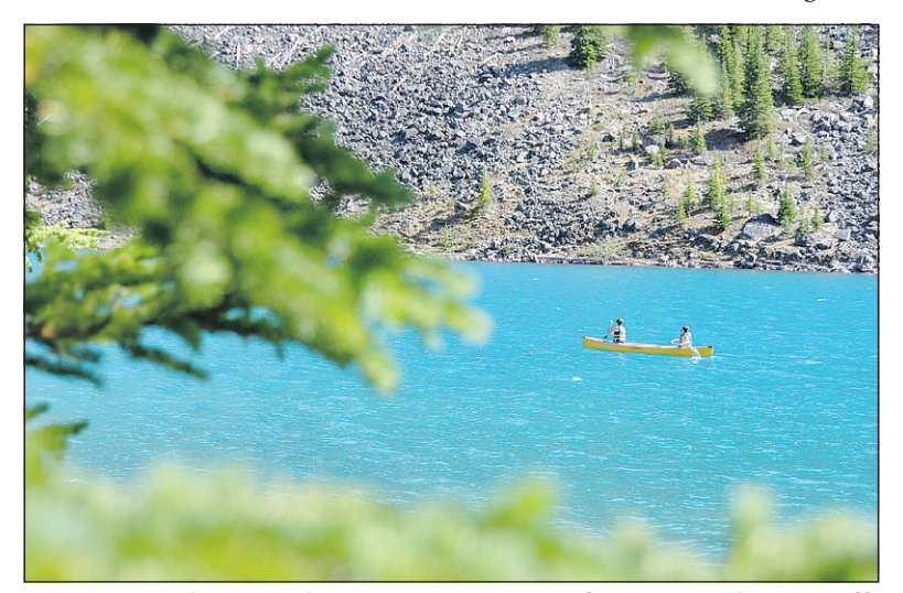
Canoeing in the surreal aquamarine waters of Moraine Lake in Banff National Park is a real treat.