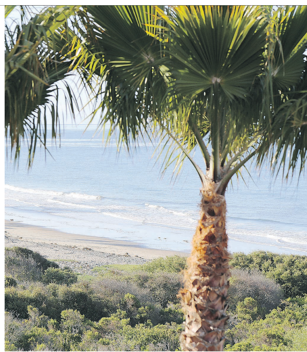
Santa Barbara features long stretches of quiet beachfront that keep kids entertained. On the right is the view from the upscale Bacara Resort & Spa.