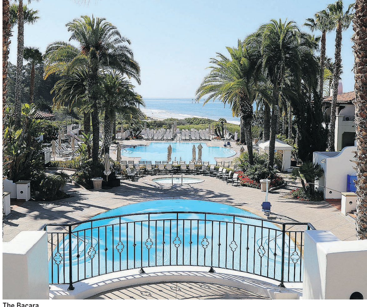
The Bacara Resort & Spa in Santa Barbara features multiple beachfront pools.