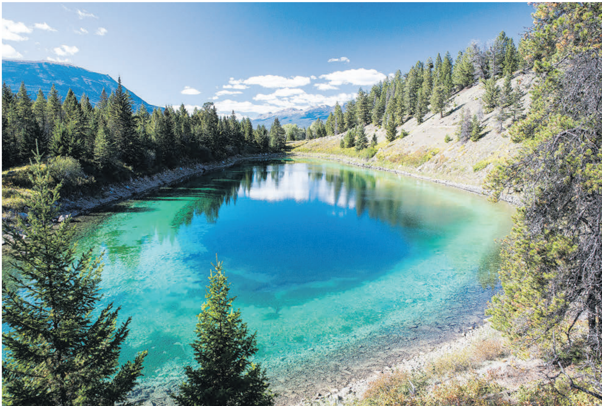
Jasper National Park has many clear lakes with unique shades of jade and blue. There's a vast openness to the scenery that is staggering.