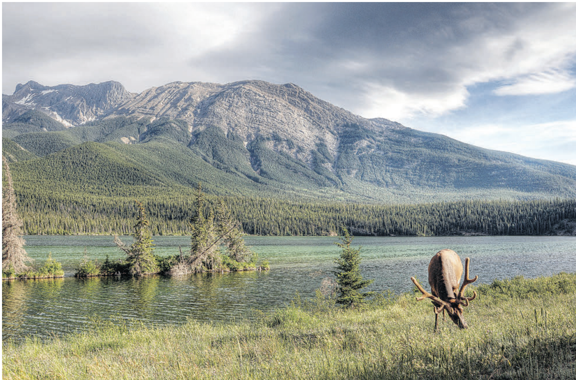
Jasper National Park is famous for its wildlife viewing, while the Icefields Parkway, below, is one of the best driving holiday routes in the world.

If it fits with your plans, travel to Jasper along the Icefields Parkway — a stunningly scenic highway that connects the national park with Lake Louise in Banff National Park.