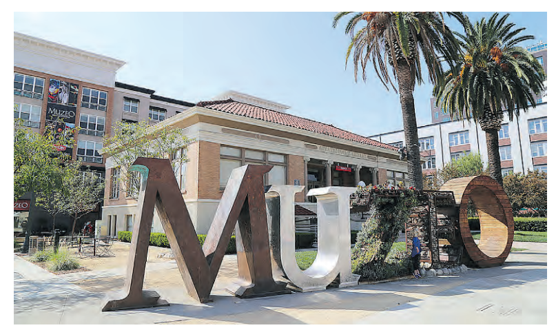
Visit Muzeo for unique arts and culture exhibitions and to learn about Anaheim's rich history.

The writer was a guest of Tourism Anaheim. No one from Tourism Anaheim read or approved of this article before publication.