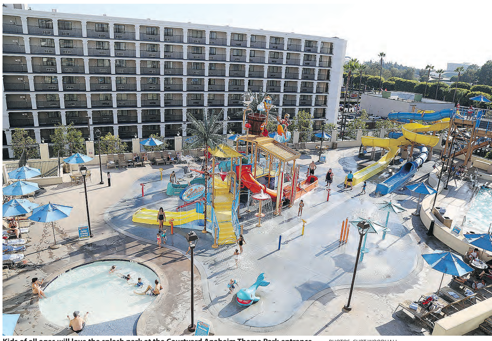
Kids of all ages will love the splash park at the Courtyard Anaheim Theme Park entrance.

Downtown Anaheim is also a hot spot for craft breweries, which we found to be surprisingly family friendly. Top picks for kids include the patio at Anaheim Brewery, where they can play around in Farmer's Park, and the comic inspired Unsung Brewing Co., for its superhero murals, action figurines, com-