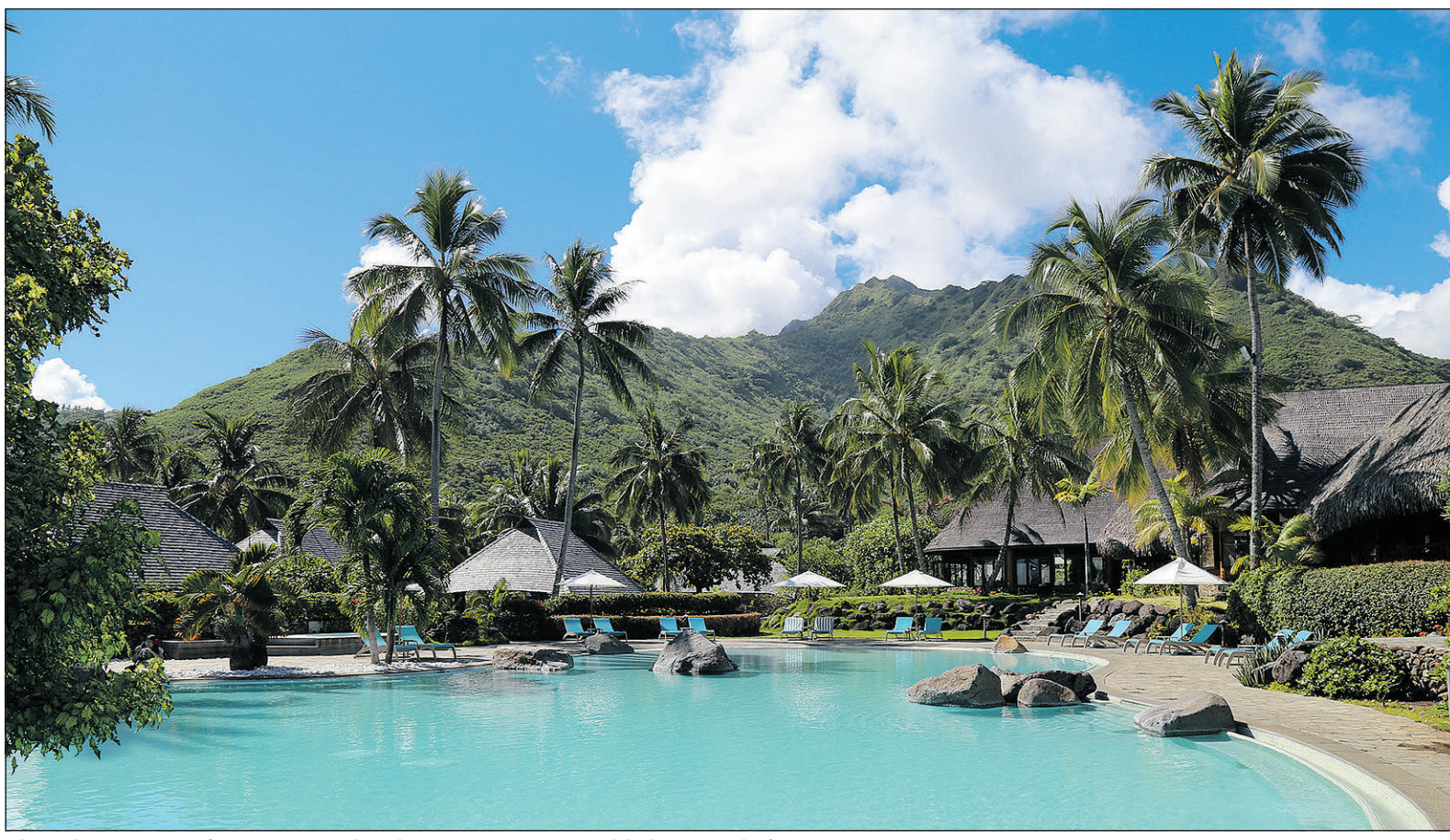
The Hilton Moorea features a pool with a view no visitor is likely to easily forget.

Tahiti's famed Friday night Roulettes — or food trucks — on the dock