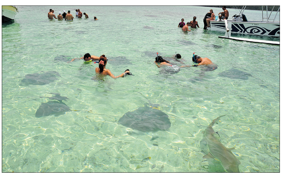
A Bora Bora snorkelling experiencee can include some swimming with black tip reef sharks and stingrays.

a relatively inexpensive culinary extravaganza and we found everything from fish and chips and barbecue to savoury and dessert crepes. Portions are huge — Tahitians love in Papeete are another big draw. It's to eat — and it's a fun way to experi-