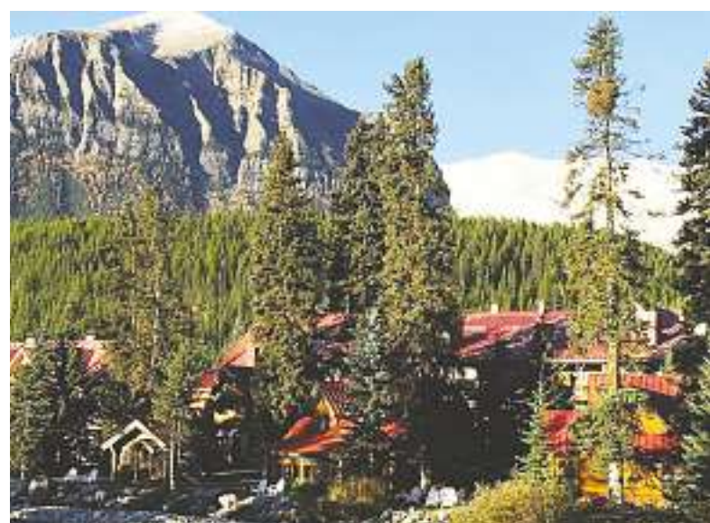
The woody Post Hotel in Lake Louise.

Prices Starting From $3899 $5499 PP 30% OFF Airfare & Taxes Included