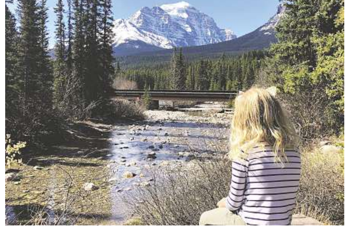
Explore the trails bordering the Post Hotel and Spa near Lake Louise for stunning scenery.

So, upon a recommendation from friends, we booked an early dinner at the Deer Lake Lodge. The hotel restaurant, part of the Canadian Rocky Mountain