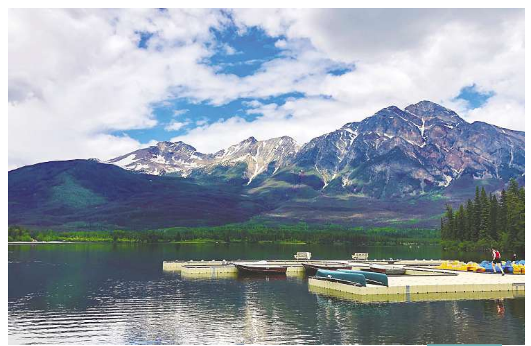
A magnificent, postcard-perfect scene in the Jasper area at the Pyramid Lake Resort.