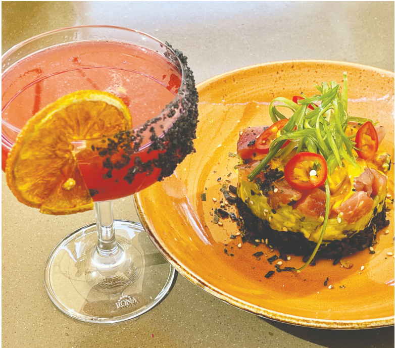
Enjoy craft cocktails and gourmet burgers at Eureka! in Indian Wells.

Walk of Stars before VillageFest kicked off at 6 p.m. The event is popular, drawing an eclectic crowd that we enjoyed watching from the patio at Lulu California Bistro. The local dining hot spot has an extensive menu, including all the standard kid-friendly staples; however, it was the prime location and atmosphere that won our family over. Following dinner, we spent our last night in Palm Springs strolling through VillageFest, shopping for trinkets, listening to live music, cheering on buskers, and satisfying our sweet tooth with mini doughnuts fresh from the fryer.