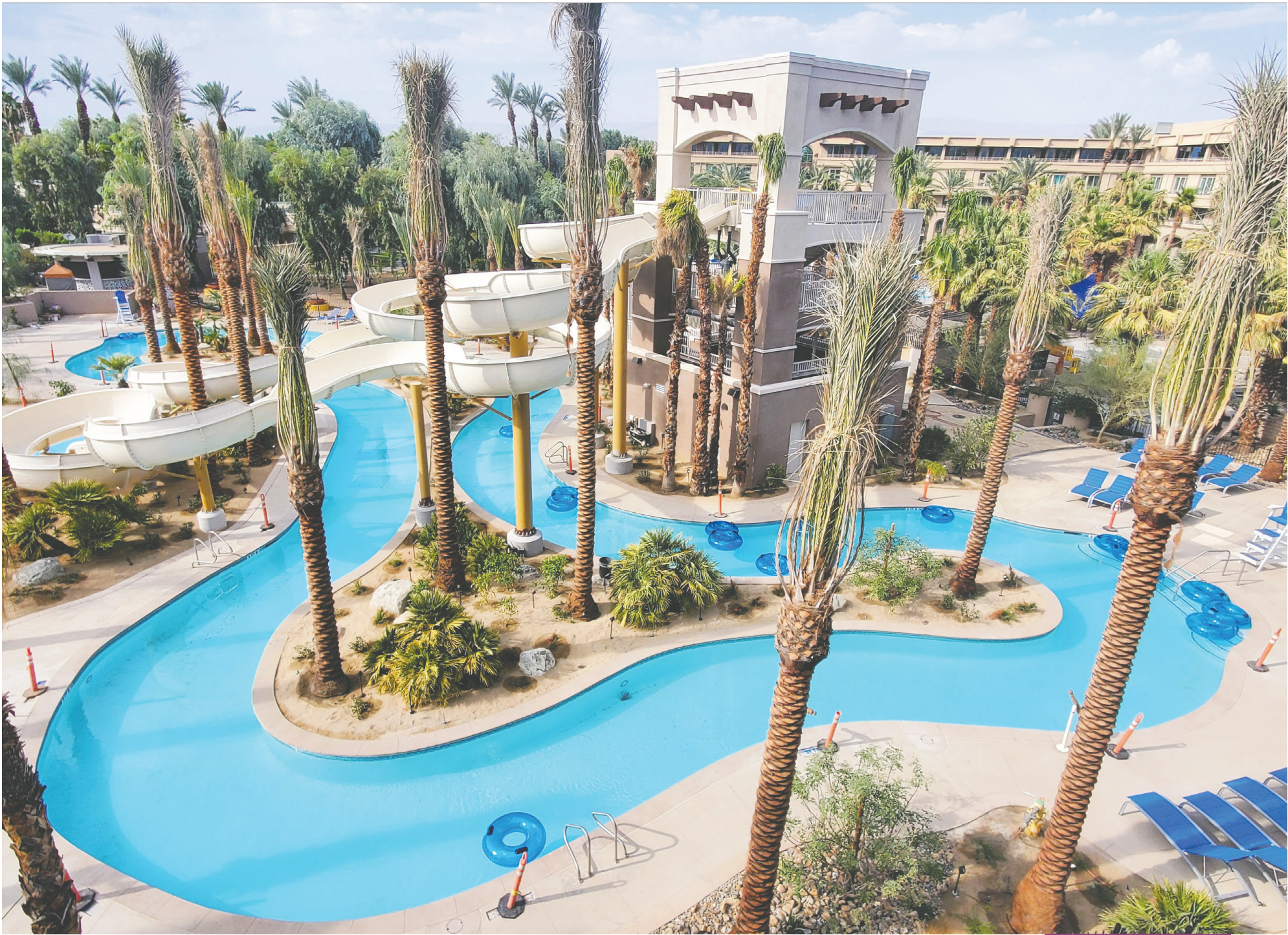
The new kid-friendly HyTides Plunge Waterpark features a pair of massive waterslides, a lazy river and a splash pad. HYATT REGENCY INDIAN WELLS