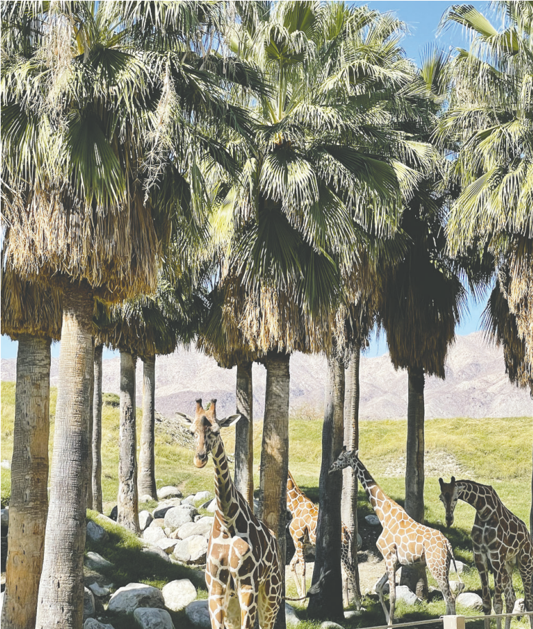
The Living Desert Zoo and Gardens offers family fun for all ages.

included three nights at the Hyatt Regency Indian Wells — a fabulous property for families travelling with children. The resort's hallmark kid-friendly feature is HyTides Plunge Waterpark, a new three-storey outdoor attraction with a pair of nine-metre waterslides, 137-metre lazy river and splash pad. In addition to the waterpark, the Hyatt features seven outdoor pools, including a dedicated adults-only pool with cabana rentals. A free tournament shuttle gets you poolside to courtside within minutes, and professional babysitting services are available through the hotel concierge. Curt spent most of his time watching matches, with me joining him for top events, like dinner at Nobu in the Tennis Garden and lawn games in the Moët & Chandon tent. I also sneaked in an age-defying fruit enzyme facial at the Hyatt's Agua Serena Spa, in between matches and the waterpark, to help counterbalance the desert's UV rays. After two tournament days, most members of our family were ready to explore Palm Springs. The Living Desert Zoo and Gardens was first on the agenda. The sprawling, immaculate grounds are stroller-friendly, and there are exhibits and activities for kids of all ages. We spent about three hours wandering through the African Safari, Wild Americas, Australian Adventurers and three nature trail loops. Highlights of our