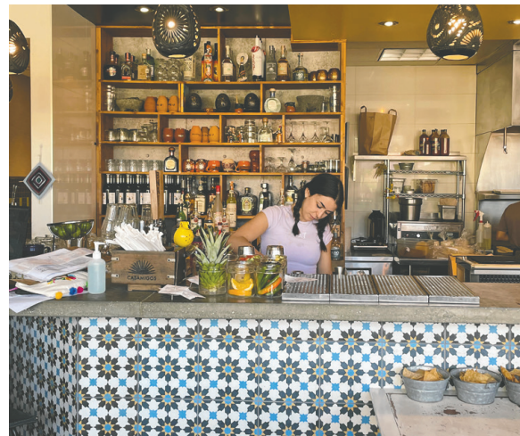
Enjoy margaritas and tacos at El Taquero, a highlight on A Taste of Kelowna Food Tours. CURT WOODHALL

owned orchards, farms, boutique wineries, and three sparkling lakes, including the iconic emerald-hued Kalamalka. Rose Hill was a new and welcome discovery for our family. Adorable barnyard buddies enjoy free range of the charming property, including recently rescued mini horses Honey, Winter and Piper, and Rose Hill’s gardening crew, comprising a small flock of babydoll sheep. By autumn, the orchard’s sweet, juicy peaches are a delight, and the apples are crisp and ripe for picking or purchase in the market. Families