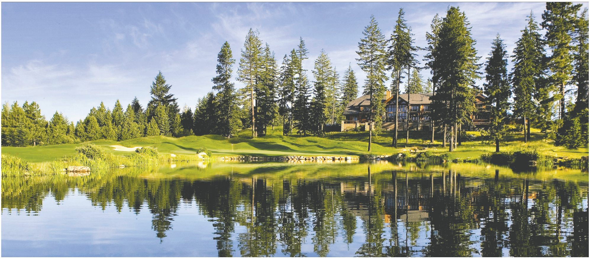
Suncadia Resort is a 6,400-acre playground nestled amid Washington's Cascade Mountains, which offers a plethora of family activities and three golf courses.