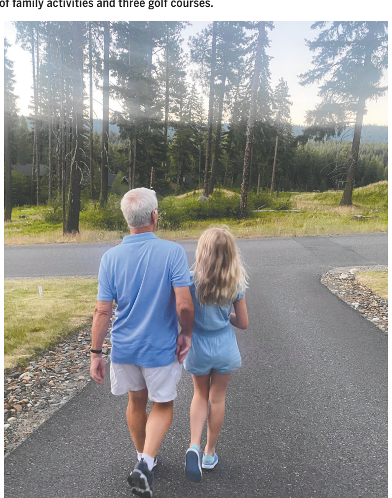
With its picturesque trails and pathways, plus three pool complexes, Suncadia Resort offers plenty of fun for the family. MHAIRRI WOODHALL